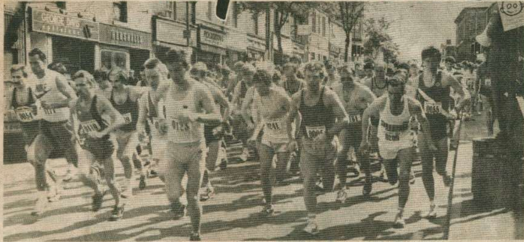
On the run — the athletes start out on the gruelling Glossop Midco half marathon